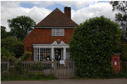
Pretty village post office