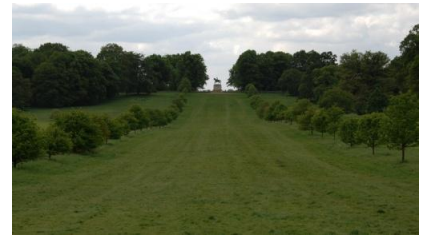
Grand tree lined avenue