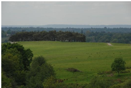
View across the estate