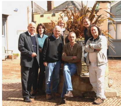
GLM with our hosts at Eridge Park